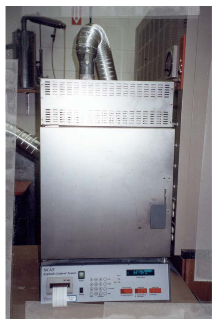
Figure 2. Asphalt Content Tester